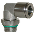
Automatic fittings in AISI 316 stainless steel, tubes from Ø 4 to 12 mm, threads from M5 to 1/2".