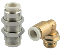
Automatic fittings in unleaded brass Series F-E PLUS and F-NSF PLUS, tubes from Ø 4 to 10 mm, threads from M5 to 1/2".