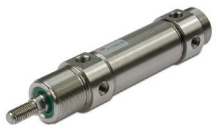
Round stainless steel cylinders, from 32 to 63 mm.