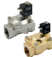
2-way servo-assisted solenoid valves, diaphragm, brass or stainless steel body.