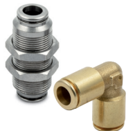
Automatic fittings in unleaded brass Series F-E and F-NSF, tubes from Ø 4 to 10 mm, threads from M5 to 1/2".